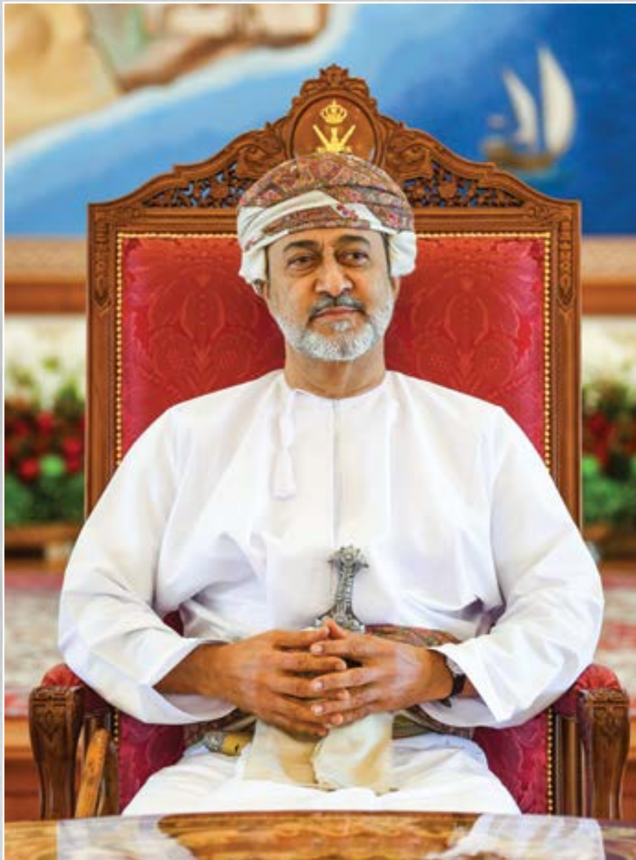
HIS MAJESTY SULTAN HAITHAM BIN TARIK