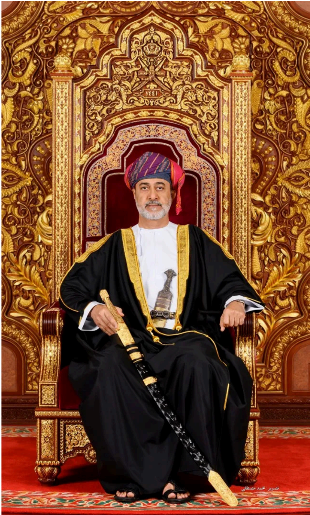
HIS MAJESTY SULTAN HAITHAM BIN TARIK MAY GOD PROTECT HIM